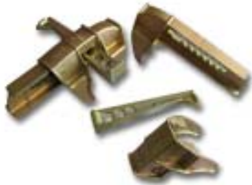
Product Modle: Construction attachments