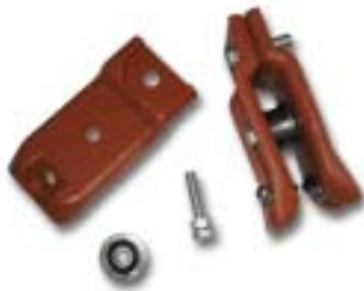
Product Modle: Construction parts