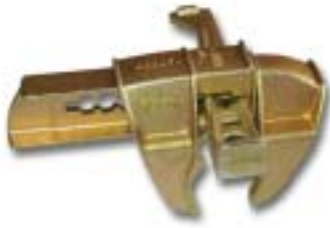
Product Modle: Construction castings