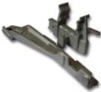
Product Modle: Scaffold spare part brackets